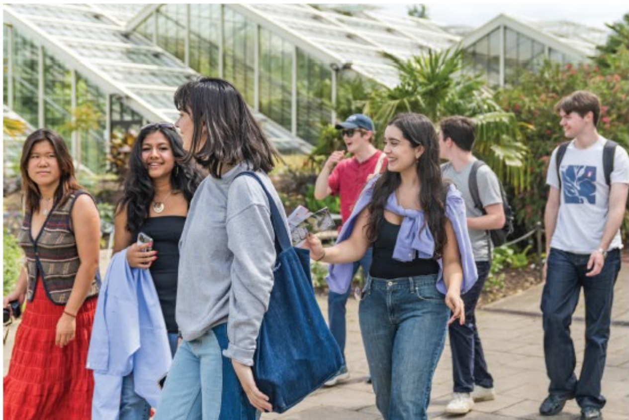
YALE IN LONDON STUDENTS AT ROYAL BOTANIC GARDENS, KEW, SUMMER 2023